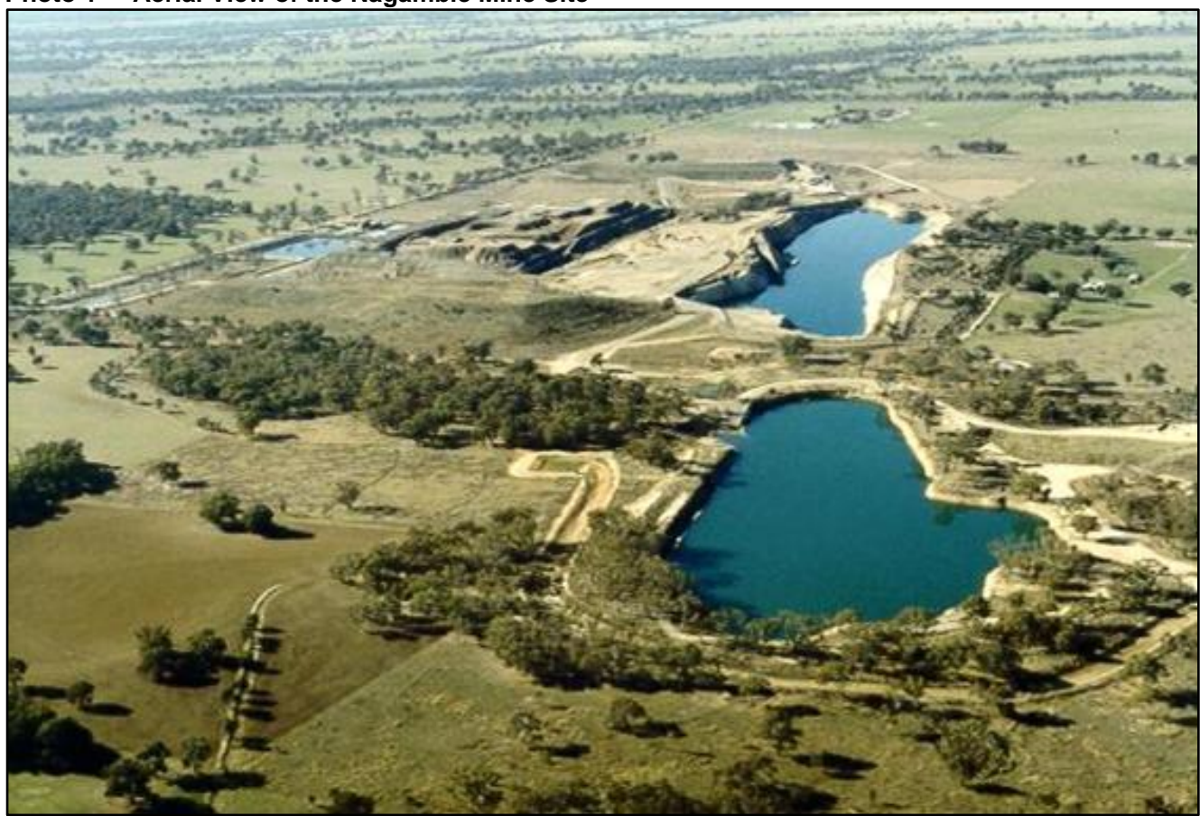
Looking north east. Water-filled West Pit in foreground, East Pit in background

PASS stands for Potential Acid Sulphate Soil (or silt or rock). PASS occurs naturally in an anaerobic state below the water table. It is soil, silt or rock containing sulphidic material such as pyrite (iron sulphide). It is classed as clean fill (EPA publication 655.1) and free of any anthropogenic ('human made') contamination. PASS is not contaminated soil. PASS is not toxic. PASS only becomes a problem when it is excavated from below the water table and exposed to the air (that is, removed from its anaerobic state) for a significant period of time. Major proposed Melbourne infrastructure projects that will involve the excavation of PASS include the Fishermans Bend / CBD high-rise developments, the Western Distributor road tunnels and the Melbourne Metro rail tunnels. Both the Western Distributor and Melbourne Metro projects have now been given the go ahead by the Victorian Government, with tunnelling due to commence around mid CY 2018.