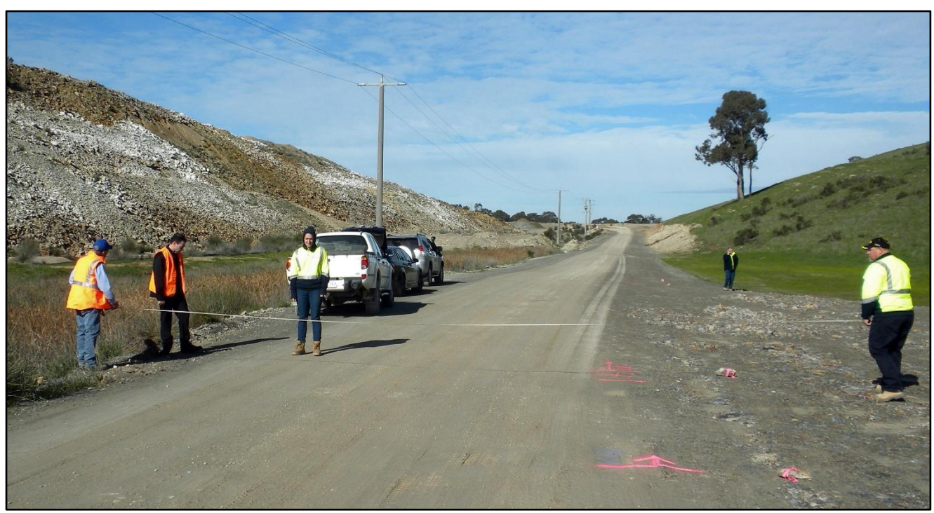
Measuring up the location for the Weighbridge

After tipping out the PASS, truck drivers will then return to and drive onto the weighbridge where they will again sign in to the driver-controlled computer station and collect a computer-printed exit docket. The docket will set out the truck registration number, the PASS job number, the associated load number, the tare (empty) weight, the gross (loaded) weight and the net load (tonnes of PASS) for record purposes.