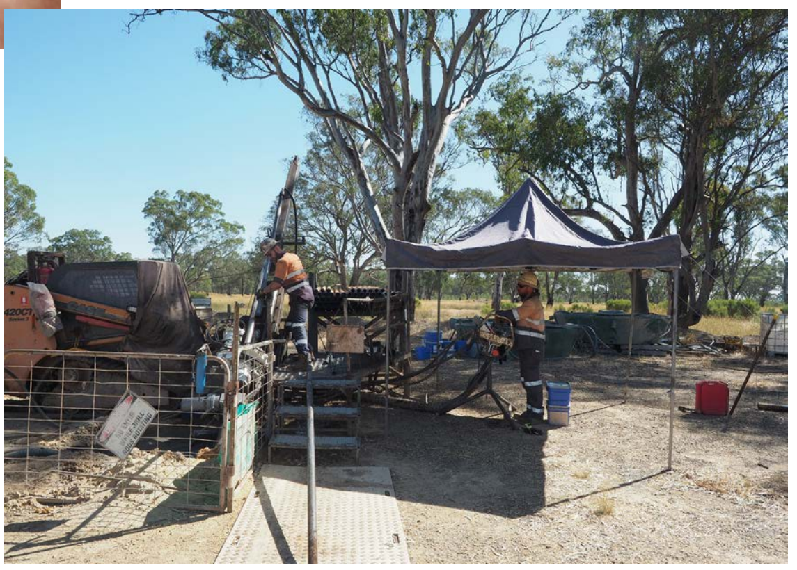
A chance discovery in historical data 12 months ago dramatically shifted the exploration thinking for Nagambie

After several stalled negotiations, Golden Camel happened upon