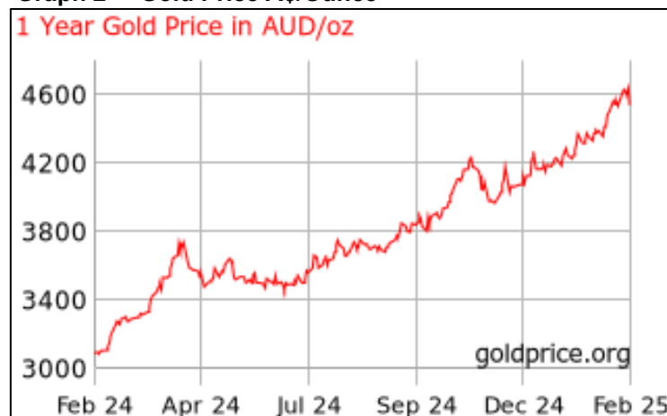
Graph 2 Gold Price A$/Ounce